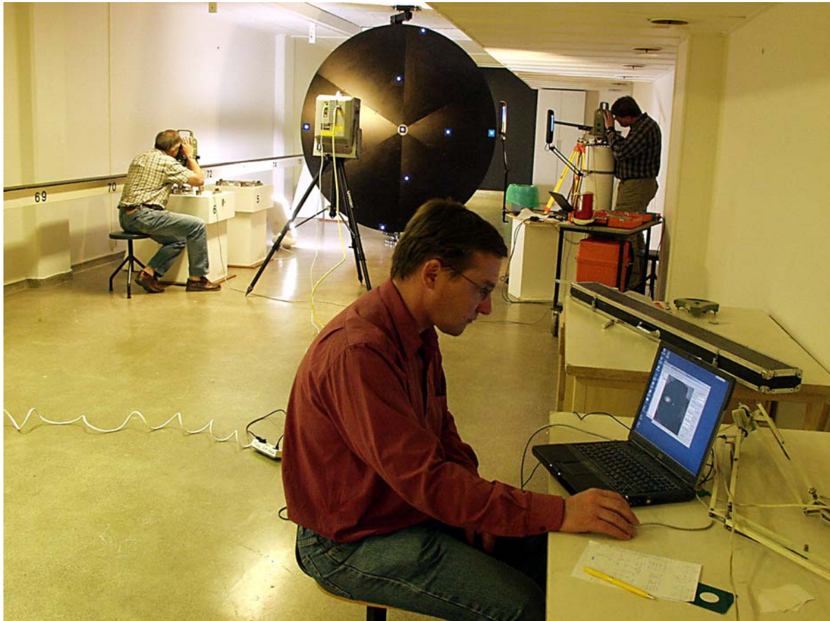
Figure 5. The operator controls functions of the Cyrax 2500 system.

At every measuring distance the 3D-reference coordinates of the object points were determined with the theodolite measuring system (Tms), (two Wild T2000 theodolites). The distance between theodolites was about 4 m, and the relative position between the theodolites and the object points was such that the spatial intersection angle was the best possible, i.e. about 110 degrees (Fig. 3 and 5). So the determination accuracy of the reference coordinates was very high 0.05 mm.