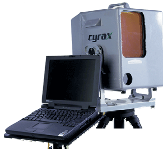
Figure 2. Cyrax 2500 3D laser scanner

The Cyrax 2500 is the world's most popular 3D ground-based laser scanner for engineering, surveying, construction and related applications. This 3D-scanner is successfully used in hundreds of projects in different countries for last two years, when production of this instrument was started (March 2001).