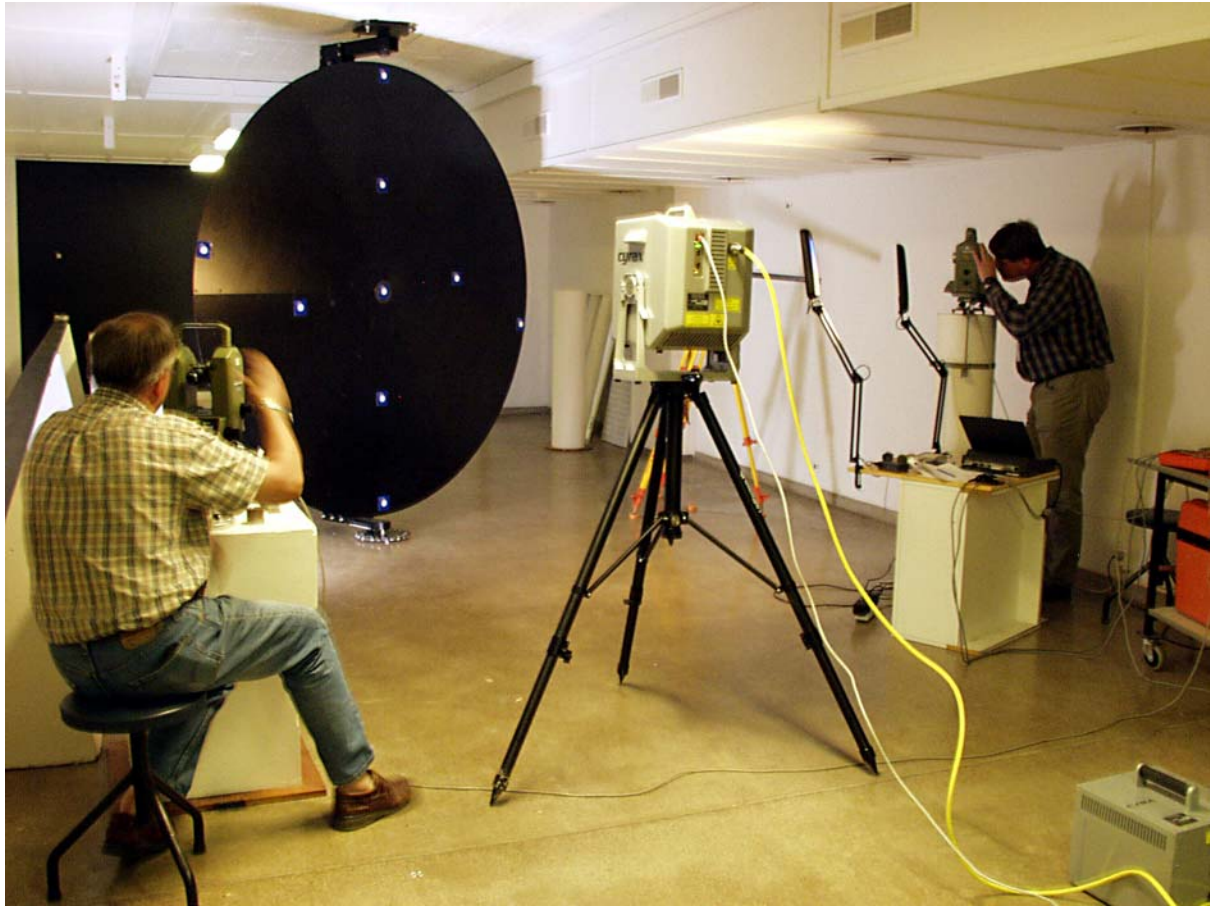
Figure 3. The determination of the reference coordinates of the object points by using the theodolite measuring system.