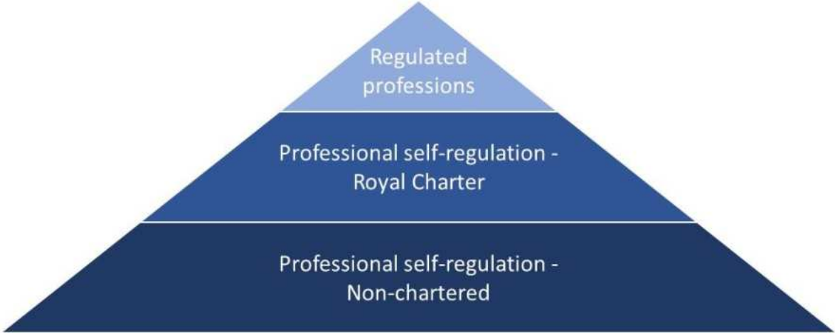
Figure 2: UK – 3-tier professional regulation system

In the UK, a 3-tier professional regulation system exists (Figure 2), which includes: (1) professions regulated by law, (2) professional self-regulation on the basis of the Royal Charter, and (3) professional self-regulation outside of the Royal Charter.