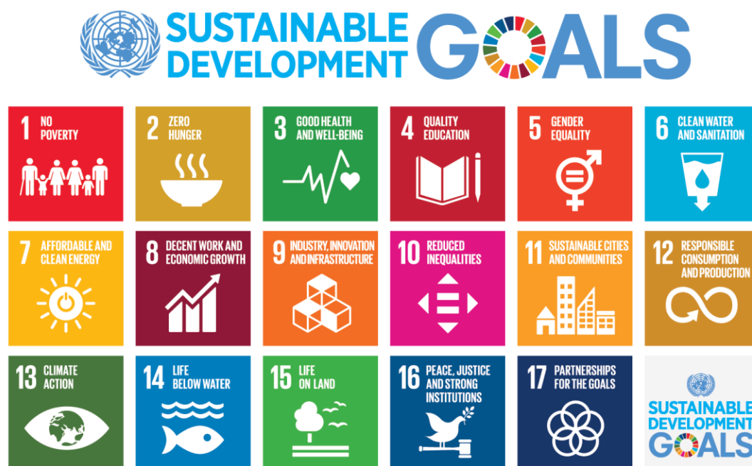
Figure 1. The 17 Sustainable Development Goals.

The UN's Sustainable Development Goals for 2030 (SDGs) place sustainable development at the top of the agenda for governments, companies and populations