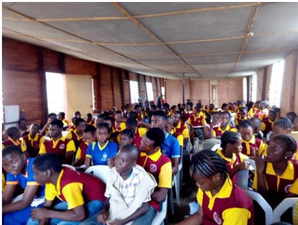
Figure 7a: Public lecture in the Classroom

The women in the region do not only carry out career talk but do some charitable work as well. Figure showed a visit to made to the home of the physical challenged in Lagos.