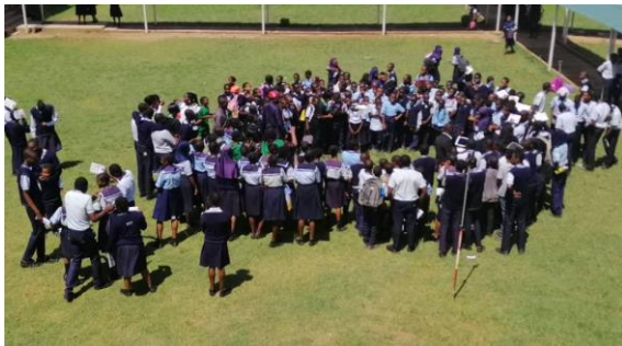
Figure 4c: The students keenly watching as the use of the drone is being demonstrated