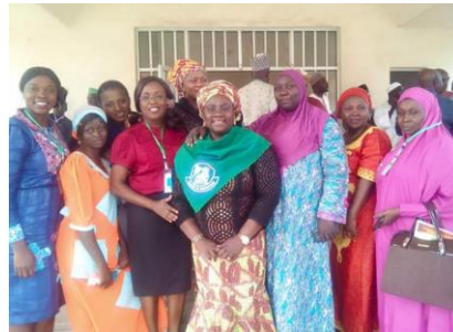
Figure 4d: Some WIS members in Northern region.