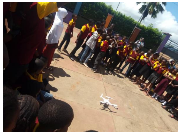
Figure 7b: Training on the use of drone.