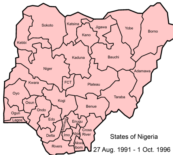
Figure 3b: Map of showing the 36 States Nigeria (Wikipedia)