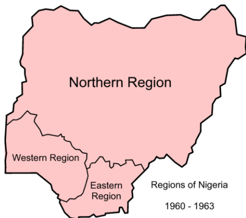
Figure 3a Map of Nigerian Regions, 1960-1963

As earlier mentioned, activities of Women-in-surveying Nigeria is run by regions. Currently there are three (3) regions, namely; the Northern, Western, and Eastern Region. As shown in figure 3a. Though these three regions metamorphosed into the present 36 States in Nigeria, Excluding the Federal Capital Territory (FCT), WIS still maintained the original boundaries of the regions and states that fell within the regions automatically became part of the region. This has helped in the management and daily running's of WIS. Figure 3b below