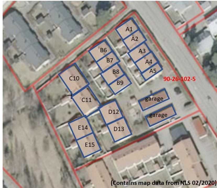
Figure 1: Housing company owns five buildings (A, B, C..) consisting of 15 owner apartments (A1, A2, A3....) and two garages. A hard copy share certificate has been issued for each apartment. The buildings are located on the real estate unit no 90-26-102-5, which has been registered in the Land Information System.

Unlike in many other countries, owner apartments, their owners and pledges have not been registered in any national register. The information on owner apartments and their owners is scattered among the 90,000 housing companies. The Finnish Patent and Registration Office maintains information on housing companies, but not on their shareholders. The Tax Administration maintains information on the owners of owner apartments for taxation purposes, but the information is not public or comprehensive. No comparable information on housing companies and owner apartments is available in a centralised manner.