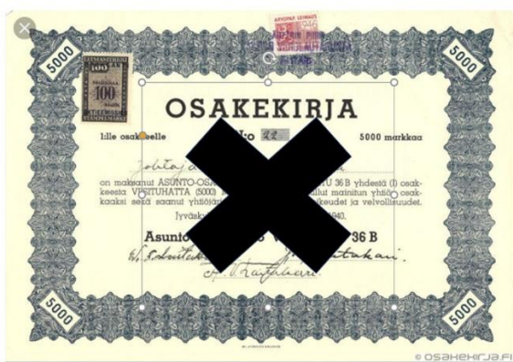
Figure 4: Each hard copy share certificate must be submitted to NLS for annulment in connection with the first registration of ownership.

The first registration of ownership will be based on the hard copy of share certificate. The original certificate must be submitted to NLS. If the share certificate has been held by a bank as collateral for a loan, a digital pledge note will be registered for the owner apartment in the same connection.