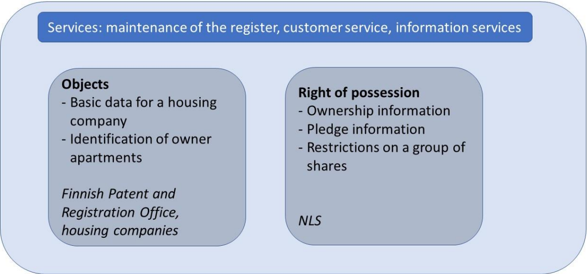
Figure 2: At the first stage, basic information on housing companies and owner apartments will be maintained in the residential and commercial property information system. Housing companies and the Finnish Patent and Registration Office will be responsible for the maintenance of this information. Information on ownership, pledging and restrictions will be registered upon application or notification, and NLS will be responsible for the registration.