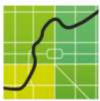
FIG Working Week 2016