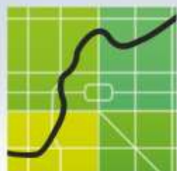
FIG Working Week 2016

The Swedish Mapping, cadastral and land registration authority