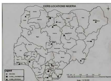
Figure 2: Location of COR stations in Nigeria