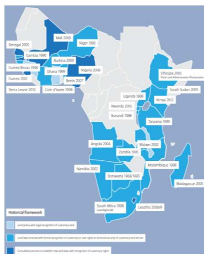
Figure 1: Land Reform in Africa