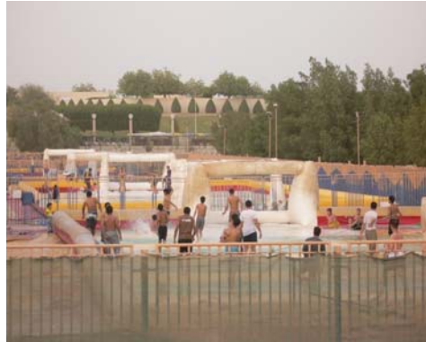
Playground Soap Water