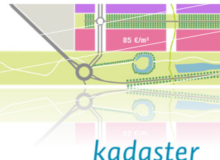
FIG Working Week Marrakech - May 2011