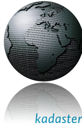
FIG Working Week Marrakech - May 2011