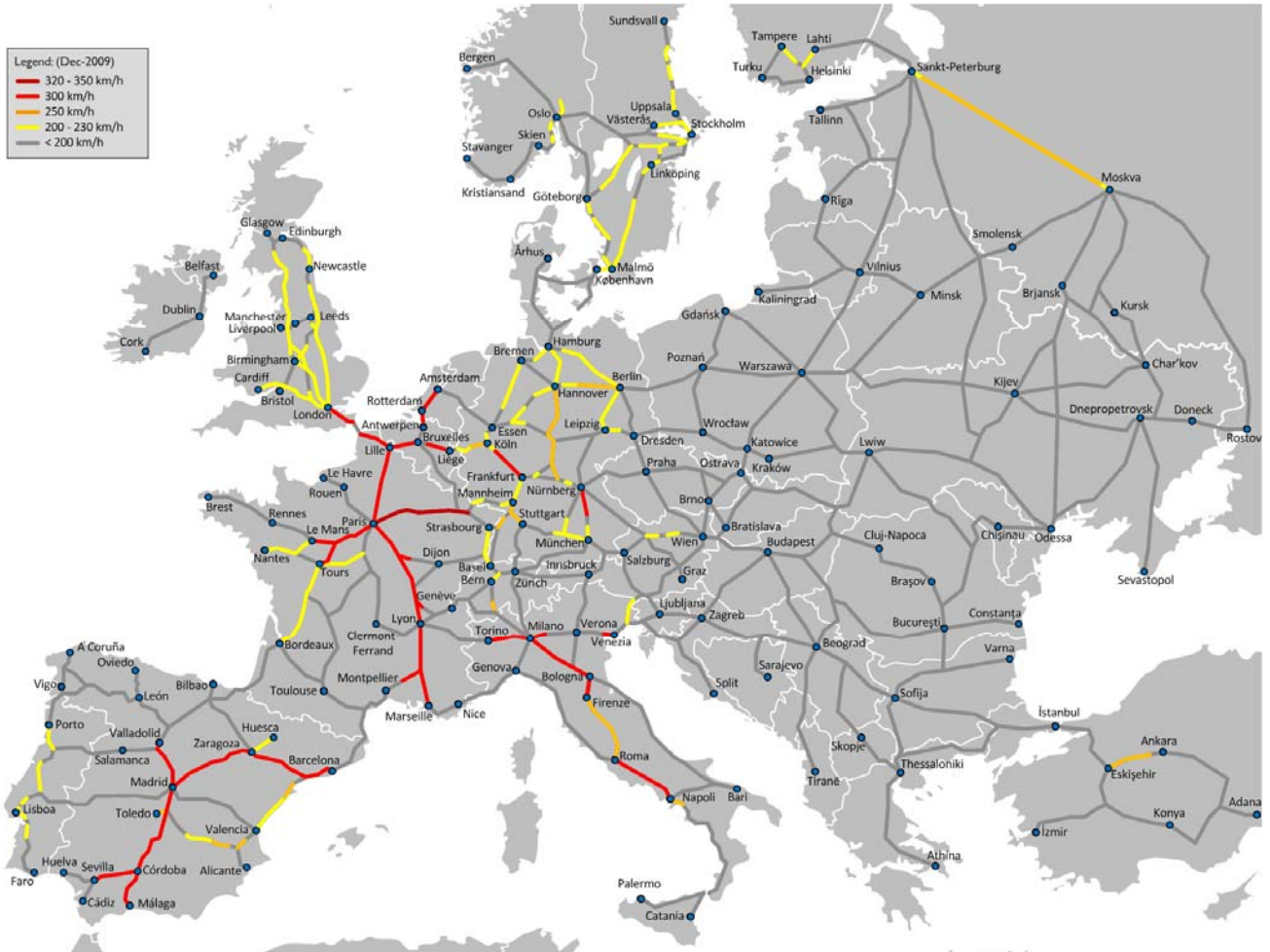
Table about the different speed in the various stretches of the railway system: