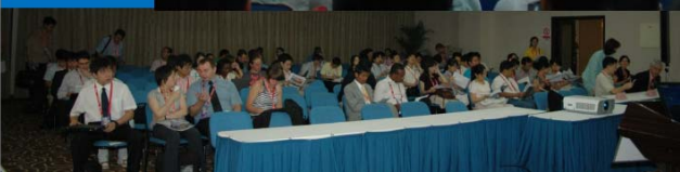
ISPRS Working Week (1st/2nd) 3-8 May 2008