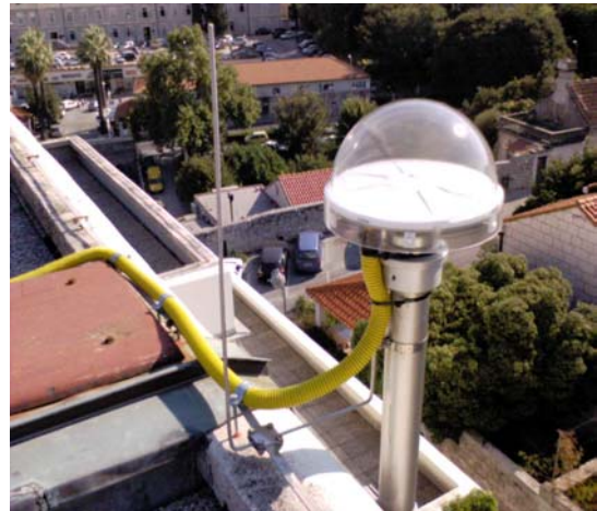
Figure 3. GNSS PS Dubrovnik

The antennae - Trimble Zephyr Geodetic GNSS are fixed to the supporting construction with the help of special adapters enabling the horizontal adjustment and routing of antennae while other devices at the location of a specific permanent station, the GNSS receiver – Trimble NetR5 – and other ITC equipment are located in standardized communications racks (Figure 4).