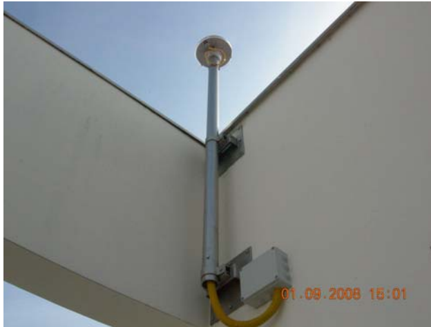
Figure 2. GNSS PS Vukovar

The antennae of base stations are stabilized with the help of uniform support constructions made of high-quality materials such as steel (INOX) and differ only in terms of the length of the supporting tube. (see: figures 2 and 3).