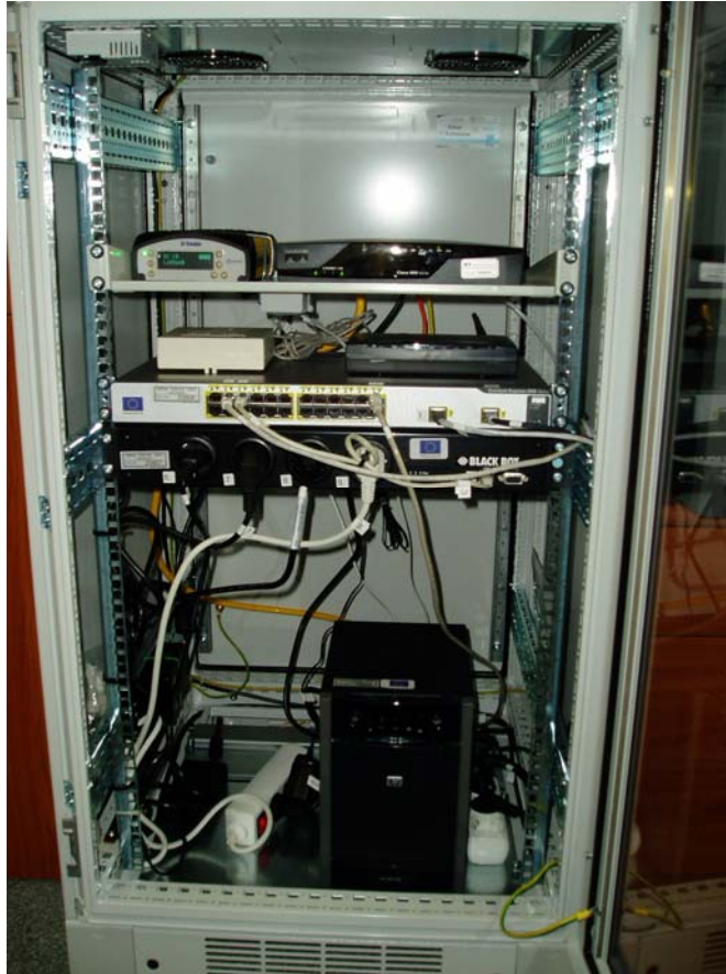
Figure 4. GNSS and ITC equipment at the PS location

In order to ensure the accuracy enabled by today's technology, the most important thing is to ensure a continuous supply of data from the permanent stations to the control centre where the data is being verified, analyzed and processed by using models that reduce or completely eliminate the negative external influences and, through the process of adjustment, compute the correctional parameters that are available to the users in real time. The Trimble GPS Net software is used for this purpose.