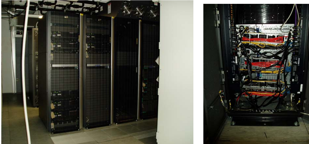
Figure 6. CROPOS Control Centre