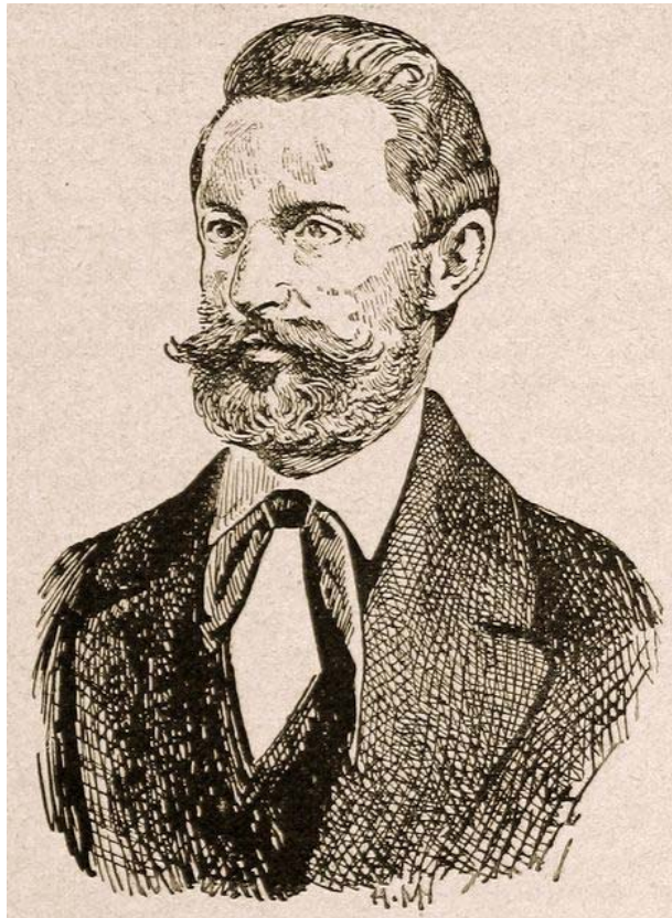
Figure 1: Portrait Ludwig Leichhardt