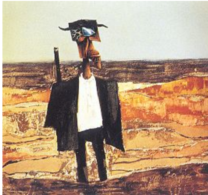
Figure 2: Portrait of Ludwig Leichhardt by Albert Tucker

Ludwig Leichhardt – Wikipedia, free encyclopaedia ( http://en.wikipedia.org/wiki/Ludwig_Leichhardt )