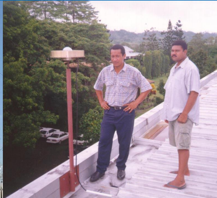
UniTech Base - LAE1 IGS Reference Frame Station