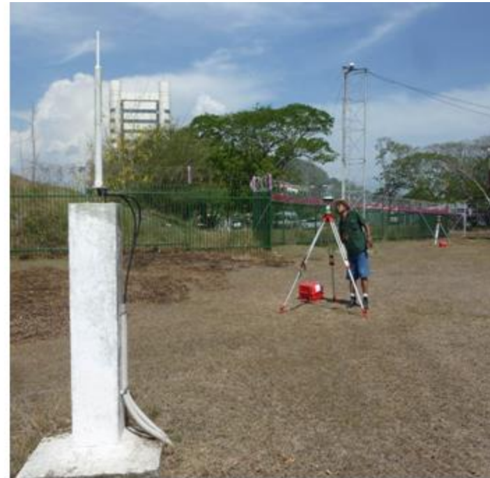
Co-located on Doris Beacon on IDS Network