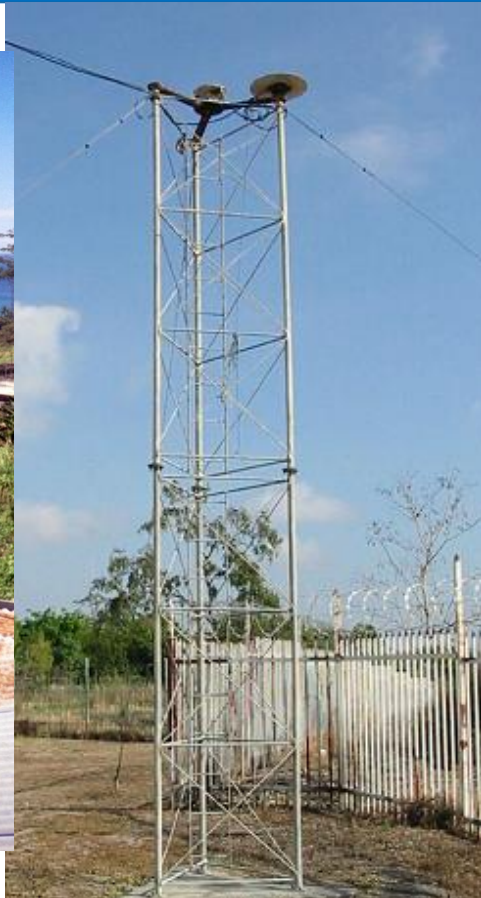
NMB Base - MORE