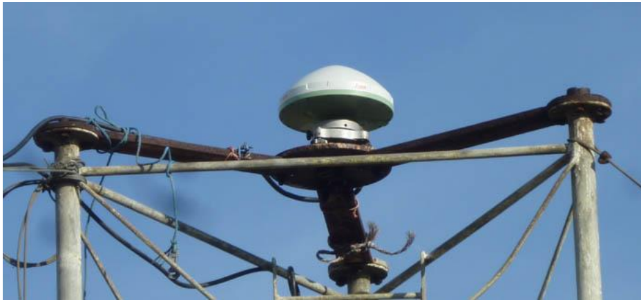
New GNSS base station on APREF at NMB2