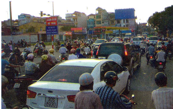
FIG in Vietnam

FIG's 7th regional conference Spatial Data Serving People: Land Governance and the Environment - Building the Capacity was held in Hanoi, Vietnam in October 2009. Over 450 delegates from 40 different countries attended to take part in over 40 technical sessions and hear almost 200 papers and presentations.