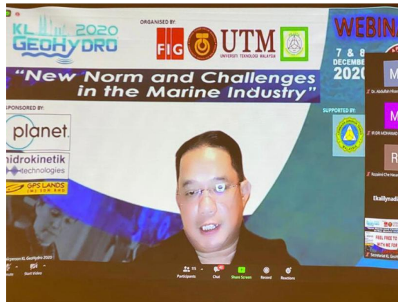
Figure 2: Speech by the Chair of Working Group 4.4 at KL GeoHydro 2020