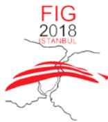
FIG Congress 2018 – Istanbul, Turkey, 6-11 May 2018

06-11 MAY 2018 EMBRACING OUR SMART WORLD WHERE THE CONTINENTS CONNECT: ENHANCING THE GEOSPATIAL MATURITY OF SOCIETIES