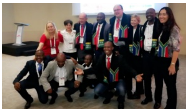
The local organising committee 2022 - Cape Town South Africa

For more details about the General Assemblies, please refer to the FIG website. Web location – http://fig.net/news/news_2018/05_ga_minutes.asp .